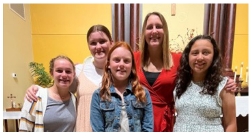
Blessed Sacrament CITY, Indiana

Fidelis chapters across the country have been holding initiation ceremonies since our last issue of The InspirIt. Below are just a few photographs of ceremonies across the country.