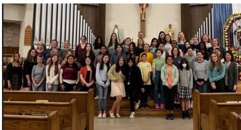
Saint Rose of Lima Murfreesboro, Tennessee