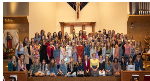
Saint Elizabeth Ann Seton Fort Wayne, Indiana