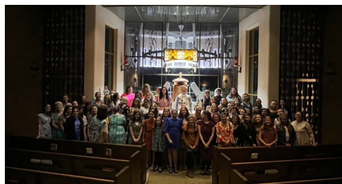
Saint Pius X Mobile, Alabama