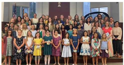
Saint Catherine of Siena Wake Forest, North Carolina