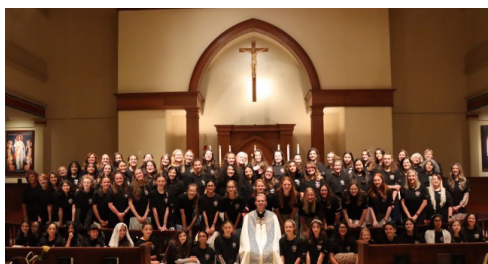
Saint Mark Huntersville, North Carolina