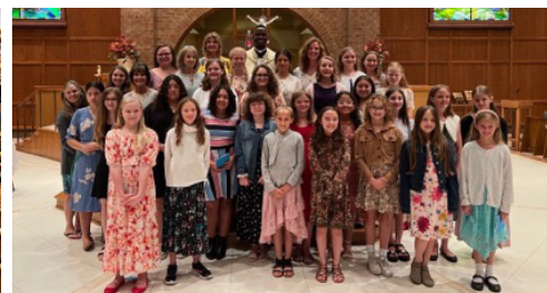
Our Lady of the Lake Hendersonville, Tennessee