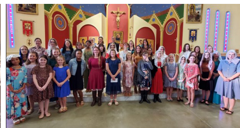
Saint Patrick Jacksonville, Florida